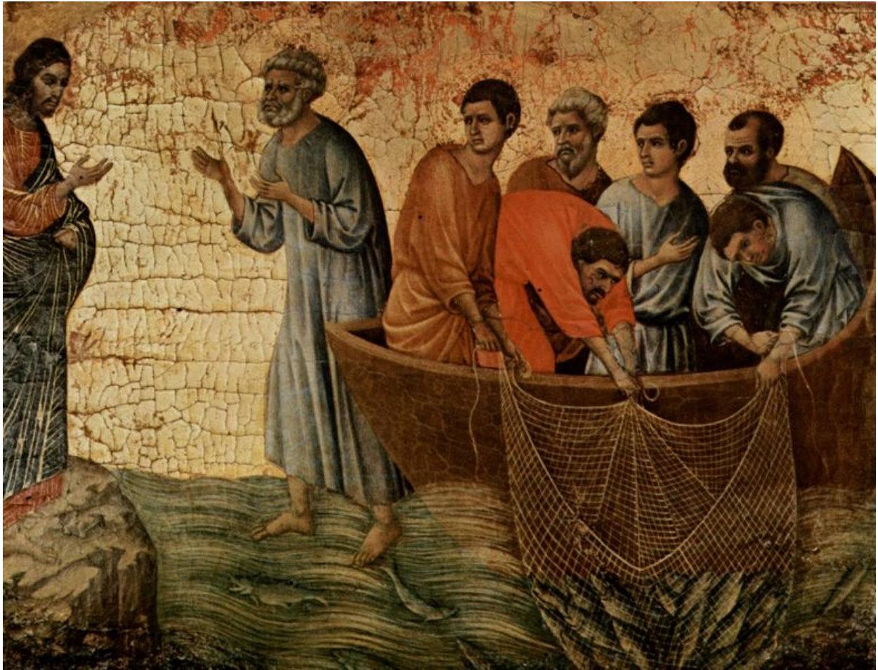
The Call of the Apostles, Fishers of Men; Duccio di Buoninsegna

“So Simon Peter went aboard and hauled the net ashore, full of large fish, a hundred fifty-three of them; and though there were so many the net was not torn” (John 21:11).